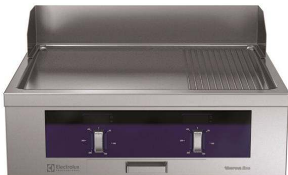
589832 (MCHOAAHODM) Electric Fry Top with smooth and ribbed chrome Plate, one-side operated - Marine

ITEM # _____ MODEL # _____ NAME # _____ SIS # _____ AIA # _____